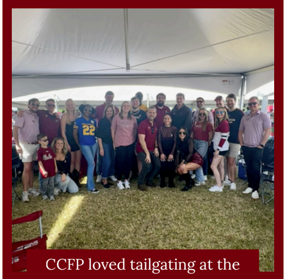
CCFP loved tailgating at the UofSC vs. Alabama game!