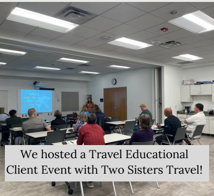
We hosted a Travel Educational Client Event with Two Sisters Travel!