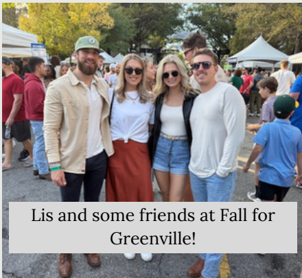
Lis and some friends at Fall for Greenville!