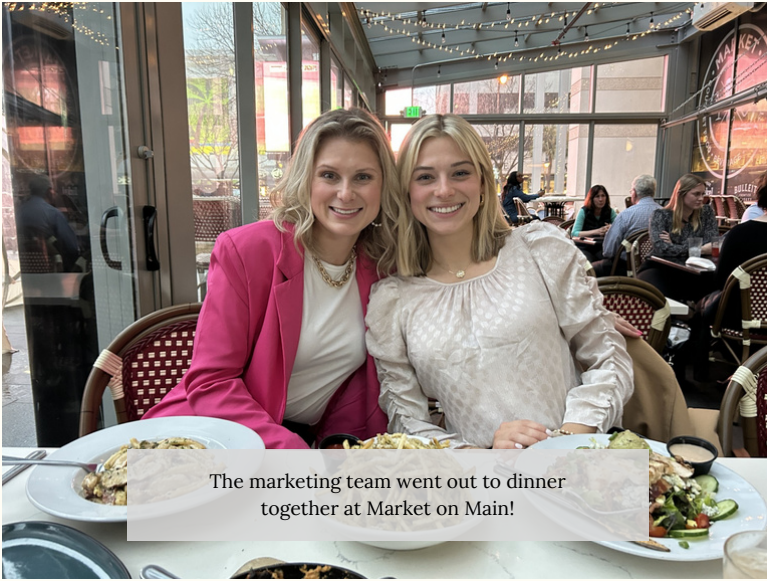
The marketing team went out to dinner together at Market on Main!