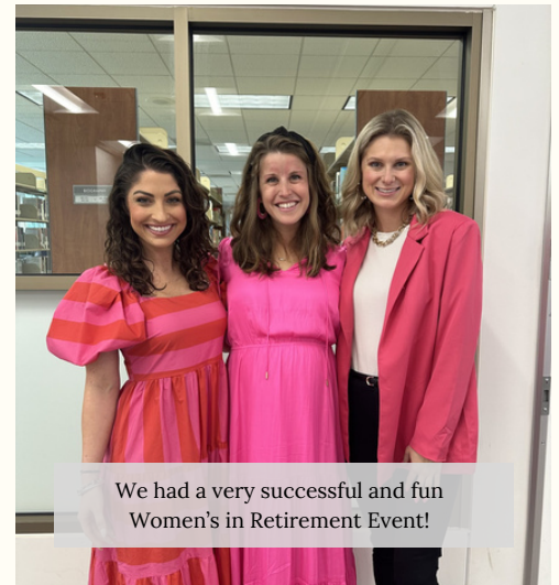
We had a very successful and fun Women's in Retirement Event!

Investment Advisory Services offered through Integrated Advisors Network ("Integrated"), an SEC Registered Investment Advisor. Registration does not imply a certain level of skill or training. Certain Representatives of Capital City Financial Partners are also registered with and offer securities through, APW Capital, Inc., Member FINRA/SIPC, 100 Enterprise Drive, Suite 504, Rockaway, NJ 07866, (800) 637-3211. Capital City Financial Partners is neither affiliated with or under common control of either APW Capital or Integrated Advisors Network.