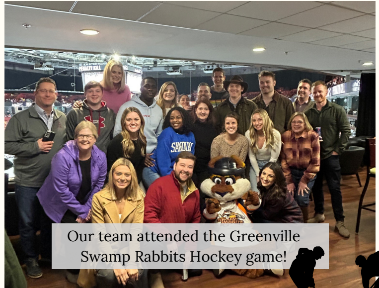
Our team attended the Greenville Swamp Rabbits Hockey game!