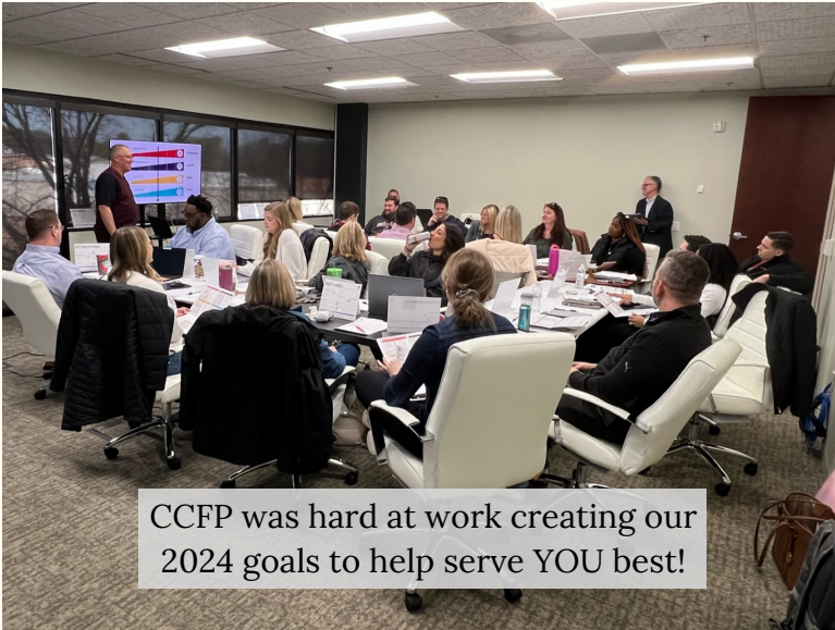
CCFP was hard at work creating our 2024 goals to help serve YOU best!