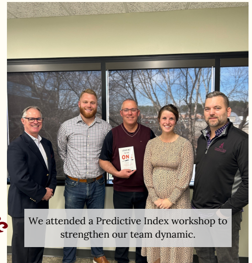
We attended a Predictive Index workshop to strengthen our team dynamic.

Investment Advisory Services offered through Integrated Advisors Network ("Integrated"). Certain Representatives of Capital City Financial Partners are also registered with and offer securities through, APW Capital, Inc., Member FINRA/SIPC, 100 Enterprise Drive, Suite 504, Rockaway, NJ 07866, (800) 637-3211. Capital City Financial Partners is neither affiliated with or under common control of either APW Capital or Integrated Advisors Network.