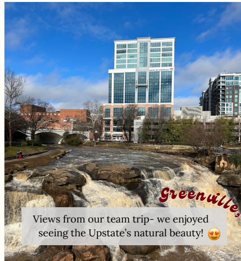
Views from our team trip- we enjoyed seeing the Upstate's natural beauty! 🥰